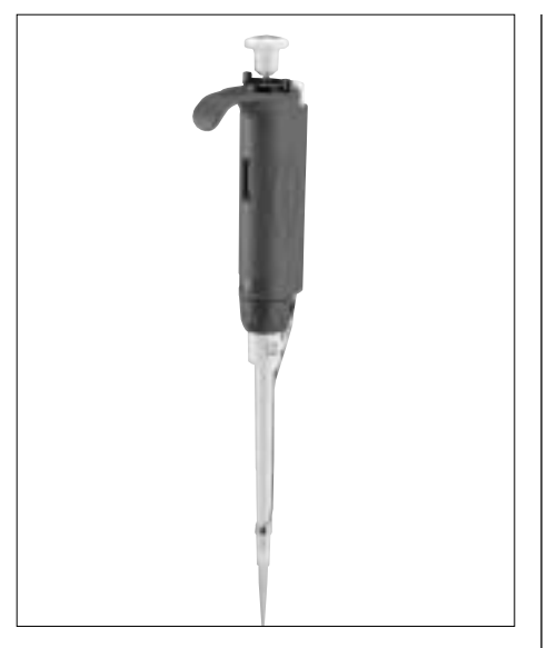
Get a Grip

Pipettes with a finger-hook make it easy to rest the hand before, during and after a pipette cycle. Your grip can be relaxed, reducing inflammation of the tendons and possible compression of the median nerve. This greatly reduces the risk of carpal tunnel syndrome and tendinitis.