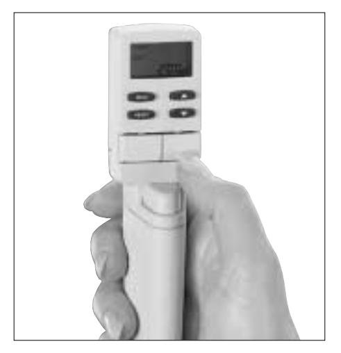
Manual vs. Electronic

Mital and Kumar found that the further the thumb needs to reach in performing lateral pinch the greater the strength required.<sup>6</sup> Choose a pipette that minimizes thumb extension.