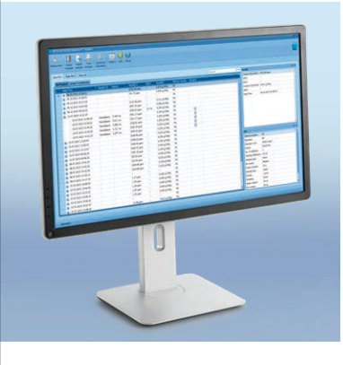
Connect your Sodium Analyzer to EasyDirect<sup>™</sup> Titration Software and improve data management. Be secure in the knowledge that all results are stored, collated and easily accessible.