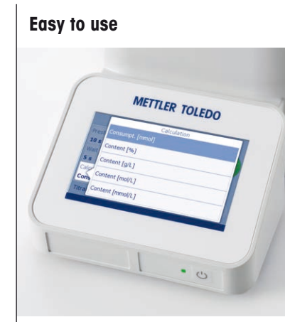
Operation could not be easier thanks to the smartphone-style Apps design used to control all major functions making it simple and intuitive to use.

This Sodium Analyzer has been specifically designed to simplify the determination of sodium in food products using the standard addition technique. There is no need for sensor calibration and only a very quick and simple sample preparation is required. Save operator time and increase productivity with fast sample measurements.